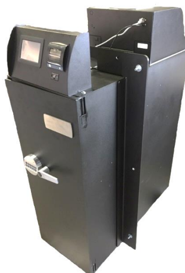
U-BUNDLE REAR 2400/4000 STACKING U-BUNDLE REAR 12000 FREE FALL