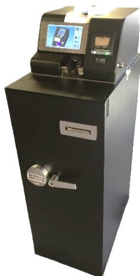
U-BUNDLE 12000 FREE FALL