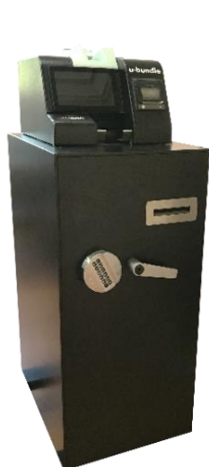
U-BUNDLE 2400/4000 STACKING