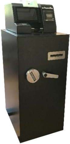
U-BUNDLE 2400/4000 STACKING