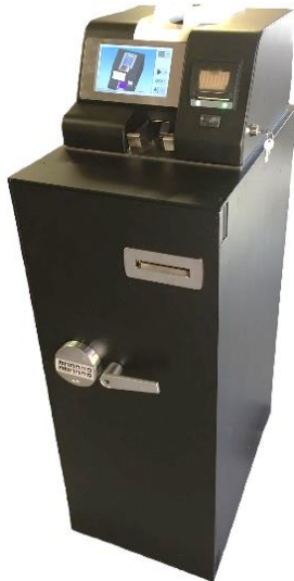
U-BUNDLE 12000 FREE FALL